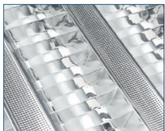
DB – version with cross-blades made of one piece (straight). For more information check option list.