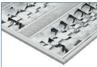
STANDARD VER- SION manufac- tured from glossy aluminium louvre and white steel body