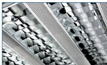
POLARIS 228 F04