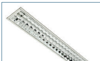
POLARIS 128 I10