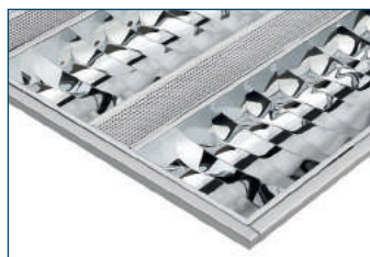
DELUXE VERSION manufactured from MIRO® aluminium louvre and matted aluminium body