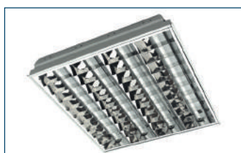
BREEZE 414 F41 9CR