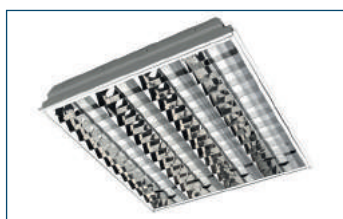
BREEZE 418 A04 11CR HF