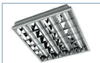
BREEZE 414 F41