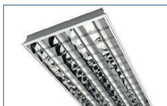
BREEZE 436 C45 HF