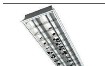
BREEZE 236 B35 HF