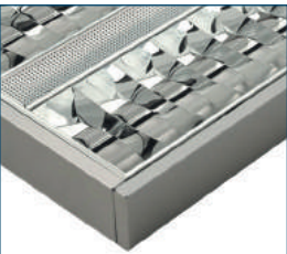
DELUXE VERSION manufactured from MIRO® aluminium louvre and matted aluminium body