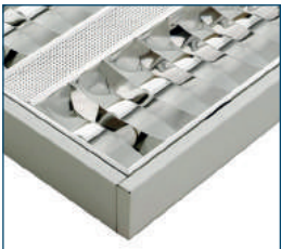
STANDARD VERSION manufactured from glossy aluminium louvre and white steel body