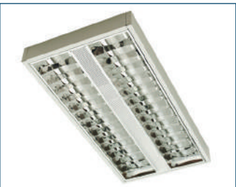
POLARIS 214 B22 DB