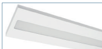
CALIMA D LED1X3600 E284 T840 MPRZ LT92

Type: A new concept of surface mounted LED luminaires with microprismatic or opal diffuser for the majority of commercial lighting applications.