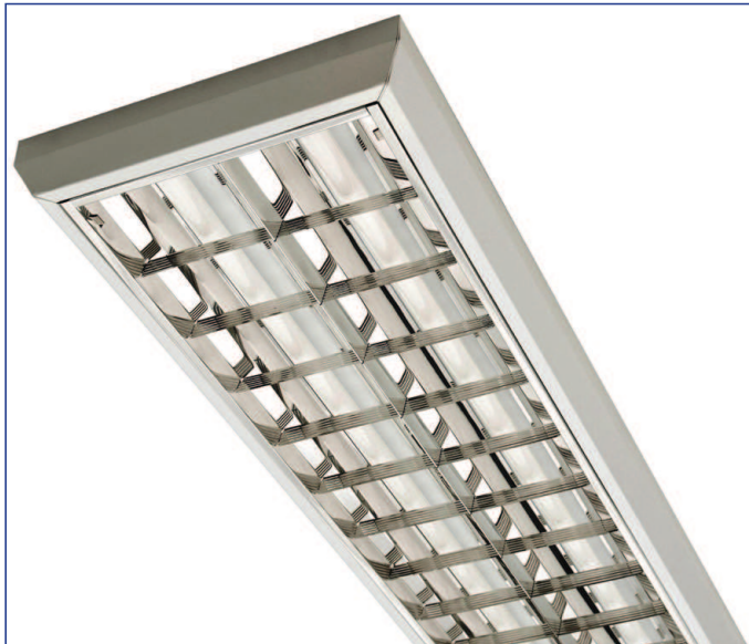
Passat 236 A32