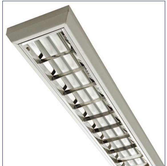
Passat 236 A33