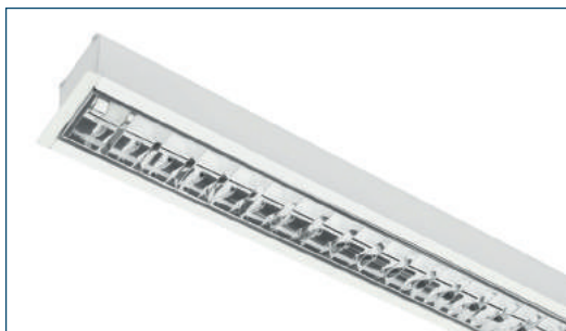
SERPENS 128 M75 PAR SB

Type: Recessed luminaire for in-line connection without gaps.