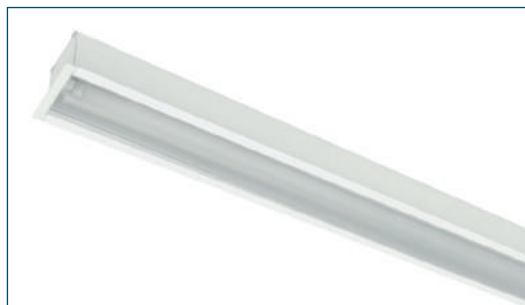
SERPENS 128 M75 PRZ SB