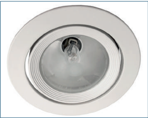
Canis 170 O17